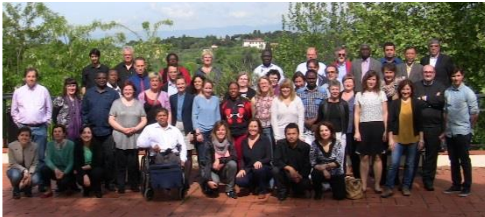
TUDCN 2015 General Meeting (Florence, Italy)