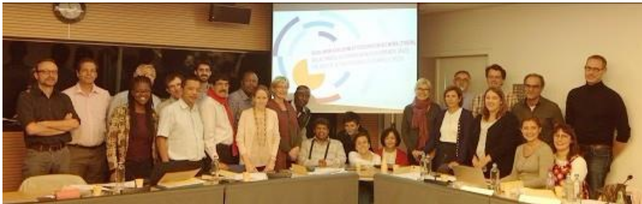
TUDCN 2015 Open Coordination Meeting (Brussels)