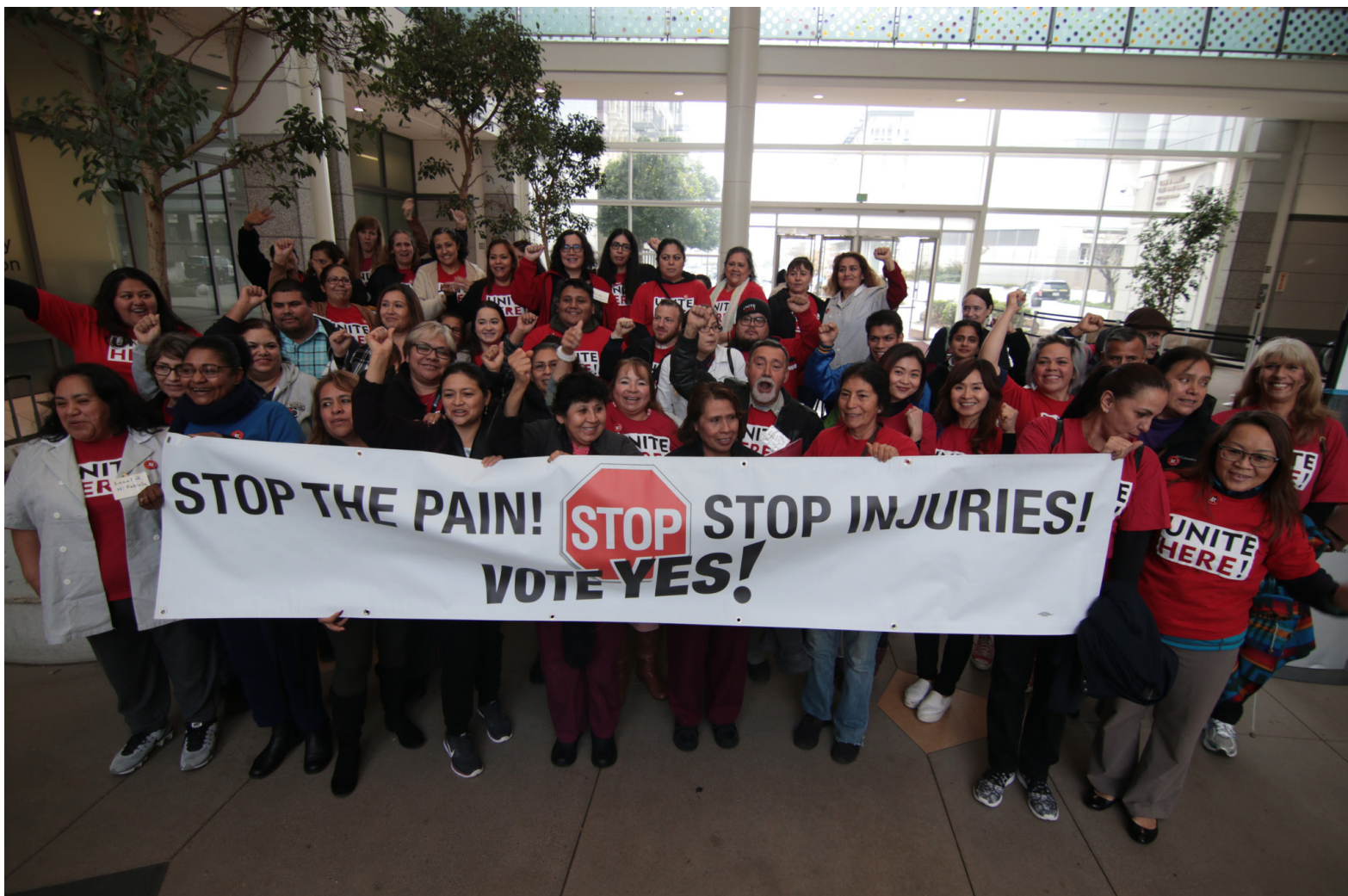
WINNING WOMEN Health and safety has been a major organising focus for hotel workers’ union Unite Here in the USA. Its members have mobilised to win a succession of laws protecting hotel workers from sexual harassment and occupational injuries and diseases.

The tactics used by US hotel workers’ union, UNITE HERE - mobilising the grassroots and piling on the political pressure - deliver results whatever the issue. In California, the ‘Hotel Housekeeping Musculoskeletal Injury Prevention’ standard was passed at a January 2018 meeting attended by hotel housekeepers from across the state. Nearly 300 UNITE HERE members from seven metropolitan areas contributed to the lawmaking process.