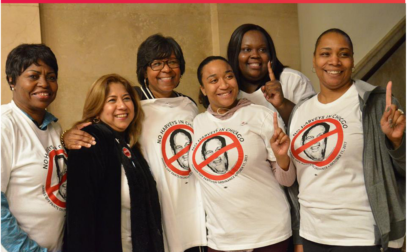
PHOTO: HANDS OFF PANTS ON

In 2016, global unions IndustriALL and IUF struck an agreement with soups-to-soaps multinational Unilever to help prevent sexual harassment in the workplace and make it easier for employees to report it.