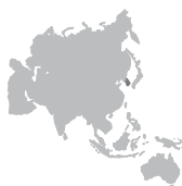
KOREA (REPUBLIC OF)