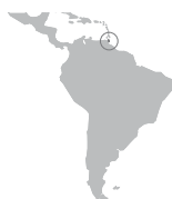
TRINIDAD AND TOBAGO

Recognition of union for collective bargaining: The beverage company AJE failed to recognise the Sindicato Nacional de Trabajadores de Bebidas, Ventas y Afines (SINTRABVA) for collective bargaining. The company refused to attend meetings convened by the National Authority for the Prevention and Resolution of Conflicts. As a result the union called a national strike which was regarded as illegal by the Minister of Labour.