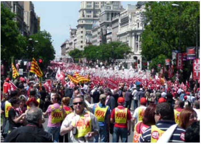
Photo from demonstration in Madrid 14 May 2009, arranged by the ETUC and Spanish unions (CC.00, UGT and USO).

350,000 people took in the streets of Berlin, Brussels, Madrid and Prague from 14-16 May 2009 to call for a New Social Deal and demanding that national governments "Put People First". The mobilisation that had been arranged by the European Trade Union Confederation (ETUC) along with the Belgian, German, Spanish and Czech unions put forward an ambitious plan to the European Council and Commission asking them to invest in more and better jobs as part of economic recovery. By committing an annual 1 percent of European GDP, investment in new, green and sustainable technologies could be ensured, more lifelong learning and quality education provided to workers to cope with the rising challenges in the labour market and a New Social Deal implemented to strengthen welfare systems and prevent social exclusion.