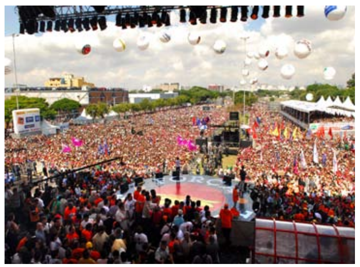
On 1 May 2009, an estimated 1.5 million workers took to the streets of Sao Paulo to demonstrate for decent work and to show how workers are ready to fight against the economic crisis.

In April 2009, representatives of UGT (União Geral dos Trabalhadores of Brazil) filed a lawsuit at the Supreme Federal Court to request that the extension of unemployment cheques benefit all workers, not solely former employees from the metallurgic, mechanic, textile, chemical, automotive and rubber industries, as determined by the Labour Minister. Since September 2008, more than 700,000 thousand workers have lost their jobs but only 103,000 of them have been entitled to receive adequate unemployment benefits.