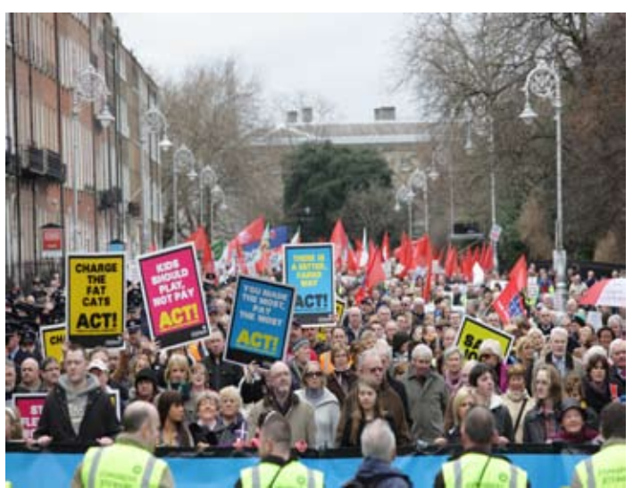
150,000 people took to the streets of Dublin in February 2009, in the biggest public protest and demonstration seen in the capital in 30 years. Protests were against the government's attempt to shift both the blame and the burden for the current economic crisis onto the shoulders of low and middle income earners, along with its failure to deal effectively with the growing jobs crisis.

In June 2009, around 7000 people in Riga and 7600 people in other Latvian cities participated in the manifestation "For Latvia. Against Injustice" organised by the Free Trade Union Confederation of Latvia (LBAS) to express their concern about the country's deteriorating economic situation.